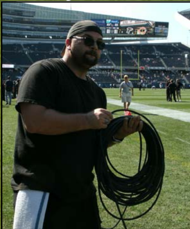
Son's of Anarchy star Ken Felde coiling cable. Over - Under - Repeat